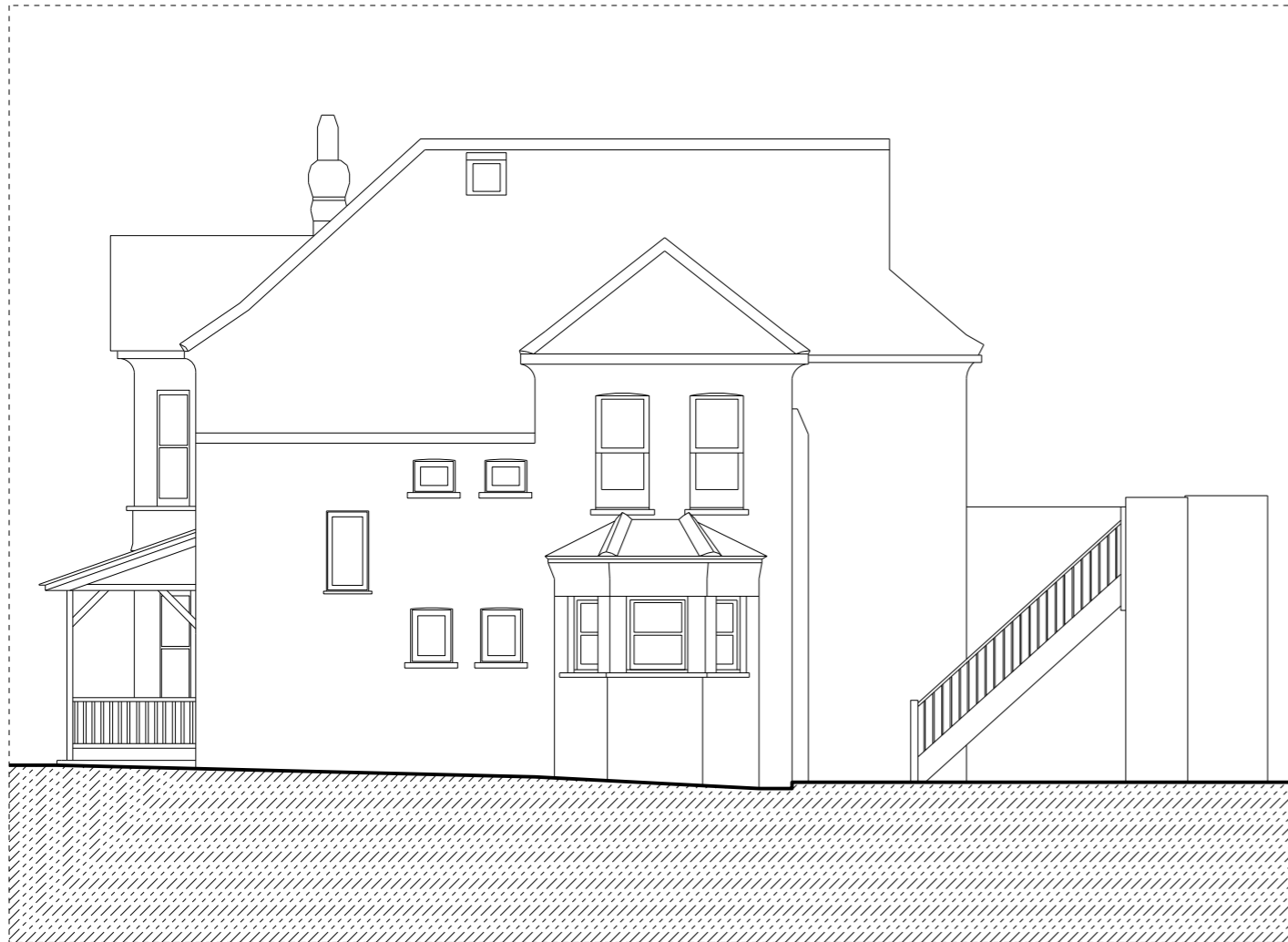
01 EXISTING NORTH ELEVATION A1021 1:100 @ A3